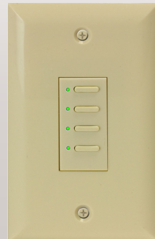
This Model: ECL-4B-4L-IVR Offered as a complete system per color (includes cover).