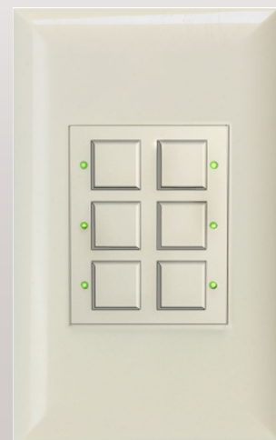
This Model: CLA-6B-6L-ALM Offered as a complete system per color (includes cover).