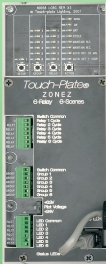
Model: 10068 Relay Control Board