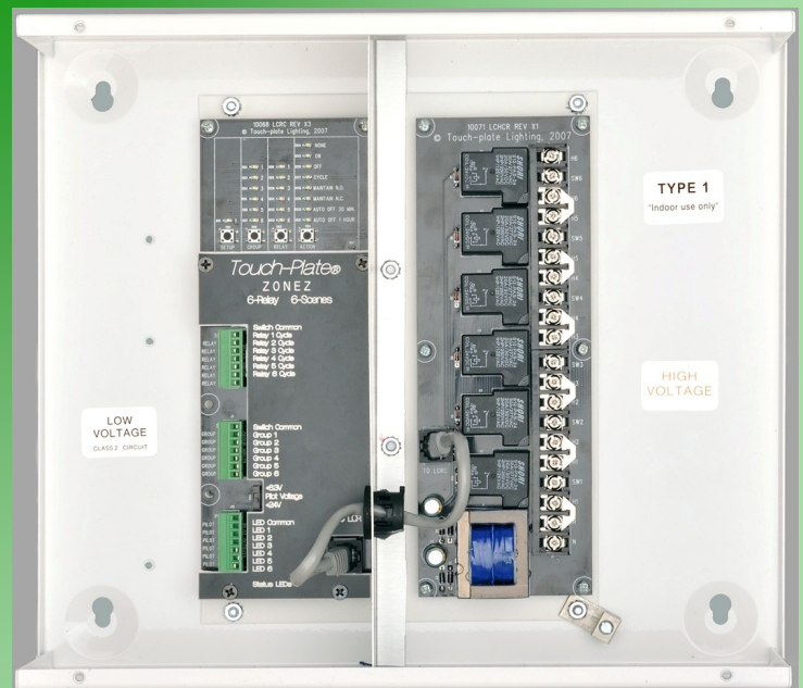
Model: ZoneZ-S-71-6RP Panel Shown is: 12"H x 14"W x 3 3/4"D