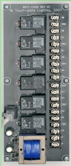
Model: 10071 Relay Board