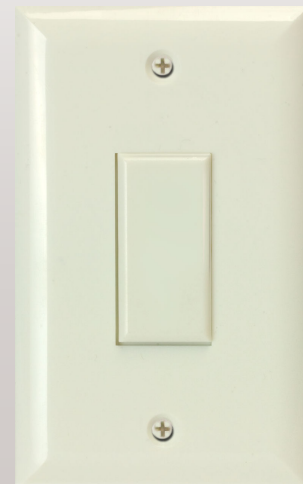
This Model: GEN-1B-WHT Offered as a complete system per color (includes cover).