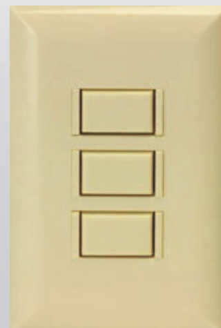
This Model: 5003-IVR Offered as a complete system per color (includes cover).